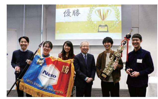
Winners of the new business idea competition among interns

In fiscal 2018, we increased the number of new recruits who are poised to take a leadership role globally to more than 100. To prevent a mismatch from occurring after they have joined the company, we offer an internship program that gives prospective employees an opportunity to experience Nitto Group's values, and about 120 students teamed up with Nitto's employees to work on ideas for new businesses. We are also aggressively recruiting people outside of Japan by, for example, inviting a select group of some 50 students who reside in Europe, Japanese and otherwise, to the Nitto ATP Finals in London for an informational session and primary screening, thus engaging in a variety of programs designed to reinforce the younger generation in our workforce and increase the diversity of our organization.